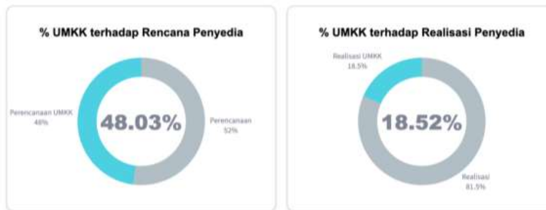
Figure 2 Data on MSMEs involved in procurement by the Cirebon Regency government

The findings show that although the PBJP procedural framework has been systematically prepared, the readiness of MSMEs to adapt to digital procurement mechanisms is still limited. These limitations are not only related to technical capabilities, but also reflect the lack of ongoing assistance and policy support at the regional level.