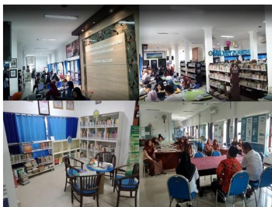
Figure 1. Existing Library

Before entering into providing recommendations on how to optimally provide interior elements that can be offered by the Pamekasan Regency Library and Archives Office, here are the existing conditions of the Pamekasan Regency Library and Archives Office.