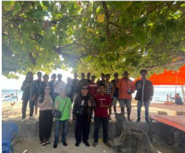
Figure 3. Interviewers and respondents

Furthermore, respondents stated a number of positive impacts from this system including benefits for the environment such as the economic benefits of waste utilization. Respondents also know the potential negative impacts of IMTA including spatial planning, location, outbreaks, and food safety issues as well as management risks. However, this source of risk can be overcome through studies and policy studies. Respondents also felt that this system would contribute to improving the aquaculture industry but there were still many problems such as species interactions that needed to be studied and classified. Respondents who know about this system are more than those who do not know. There is a gap in a study conducted in Canada that 78% of the participants who attended the FGD had never heard of the term IMTA (Barrington et al. 2009). Respondents who are directly involved in aquaculture understand more because of interest, cultivation progress and cultivation technology.