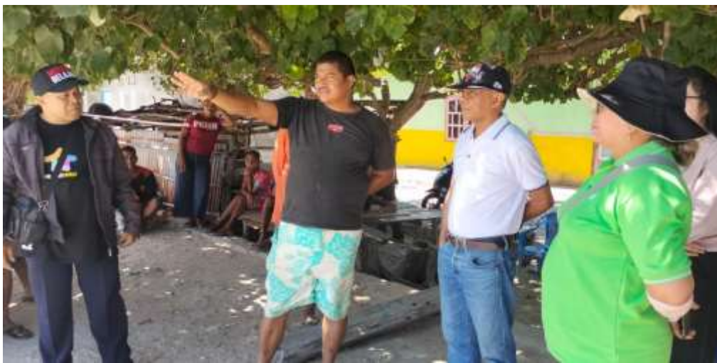
Figure 2 Interviews with fishermen groups

"There is a conflict in the use of space among fishermen groups"